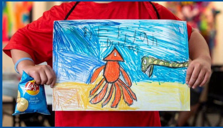
Elijah proudly displaying his latest masterpiece